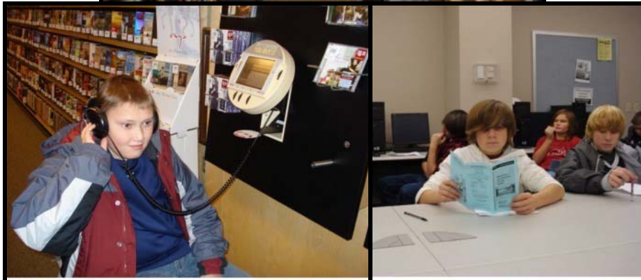
8th Grade students enjoy Barnes and Noble and Penn State Altoona on their Literacy Field Trip.